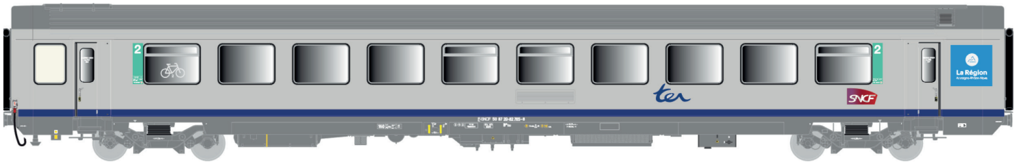
Set 41 206 A5B5tu+B10tu+B10tu, Livrée TER Rhône-Alpes / Livrée TER AURA, logo carmillon Ep.VI